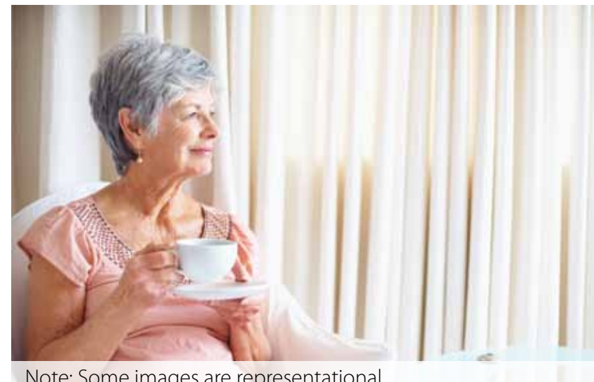
Note: Some images are representational